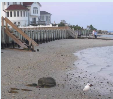
Bird feeding on invertebrates that inhabit a tidal beach vulnerable to rising sea level along Peconic Bay in Riverhead.

sea. Those beaches provide nesting sites for horseshoe crabs, which are a key source of food during spring for migrating shorebirds, such as the endangered red knot. Other shorebirds feed on these beaches throughout the year. Vulnerable tidal flats provide habitat for soft clam, hard clam, bay scallop, and blue mussel.