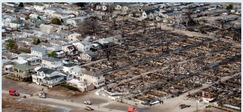
Breezy Point, Queens, in the aftermath of an electrical fire ignited by floodwaters during Hurricane Sandy.

Rising sea level increases the vulnerability of coastal homes and infrastructure to flooding because storm surges become higher as well. Although hurricanes are rare, much of the infrastructure in the New York metropolitan area is vulnerable to flooding. In 2012, high waters during Hurricane Sandy flooded Amtrak, PATH, and subway tunnels, as well as electrical substations, wastewater treatment plants, telecommunication facilities, hospitals, and nursing homes. Wind speeds and rainfall rates during hurricanes and tropical storms are likely to increase as the climate warms. Rising sea level is likely to increase flood insurance premiums, while more frequent storms could increase the deductible for wind damage in homeowner insurance policies.