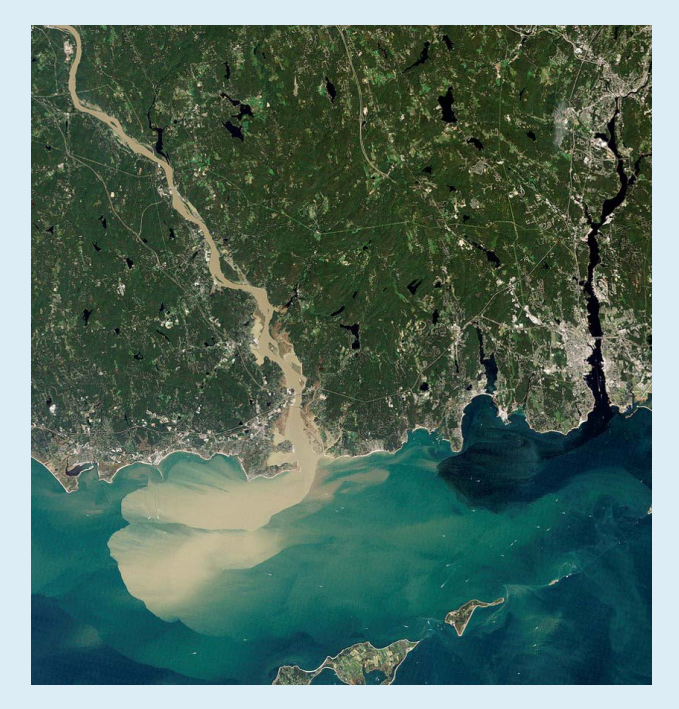
In 2011, Hurricane Irene filled the Connecticut River with muddy sediment as a result of erosion upstream. Heavy storms are becoming more common as a result of climate change.

Rising temperatures and shifting rainfall patterns are likely to increase the intensity of both floods and droughts. Average annual precipitation in the Northeast increased 10 percent from 1895 to 2011, and precipitation from extremely heavy storms has increased 70 percent since 1958. During the next century, average annual precipitation and the frequency of heavy downpours are likely to keep rising. Average precipitation is likely to increase during winter and spring, but not change significantly during summer and fall. Rising temperatures will melt snow earlier in spring and increase evaporation, and thereby dry the soil during summer and fall. So flooding is likely to be worse during winter and spring, and droughts worse during summer and fall.