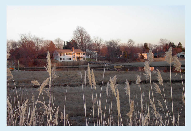
Coastal marshes in Old Saybrook and nearby properties are at risk from sea level rise.

Coastal cities and towns will become more vulnerable to storms in the coming century as sea level rises, shorelines erode, and storm surges become higher. Storms can destroy coastal homes, wash out highways and rail lines, and damage essential communication, energy, and wastewater management infrastructure.